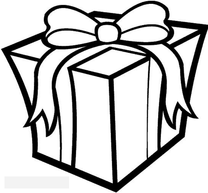
THE GIFT OF GOD'S GRACE